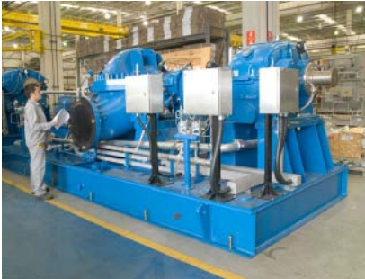
HPDM pump in final inspection before shipment.