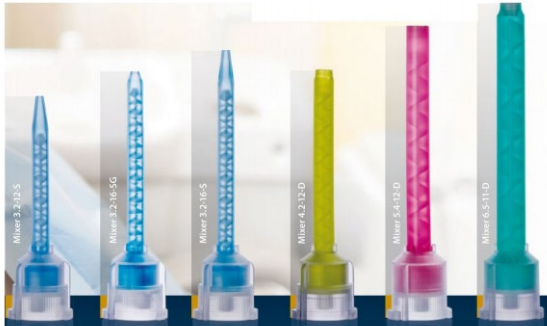
Fig. 1: Mixing Tips from Undertaking

penalty) that the following dental mixing tips (below) should not be offered anymore: