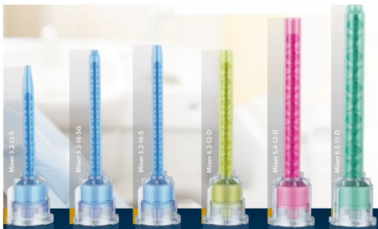
Fig. 2: Ritter slightly different Mixing Tips

Soon thereafter, Ritter however began offering and selling the slightly different dental mixing tips (below). After its negotiation efforts failed to resolve the dispute, Mixpac filed a lawsuit to end the breach of the agreement, and, as requested, the district court of Munich (Landgericht München I; 37 O 852/20) granted an injunction against the defendants Ritter GmbH, Frank Ritter, and Ralf Ritter, and ordered that the Ritter Defendants must stop offering those slightly different dental mixings tips (below).