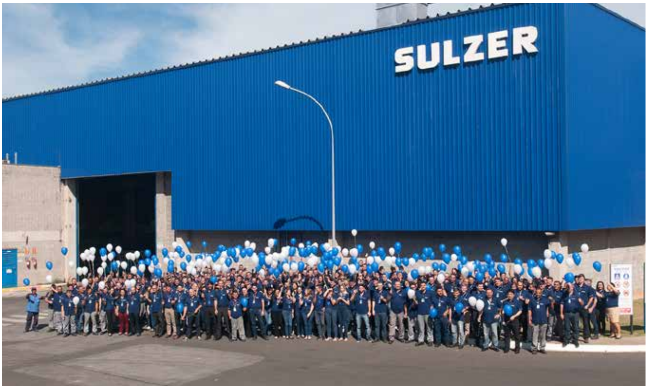
The Sulzer Brasil S.A. family

Equipment downtime means lost profit. Sulzer understands this and delivers reliable, high quality, round-the-clock service solutions supported by world-class technical expertise.