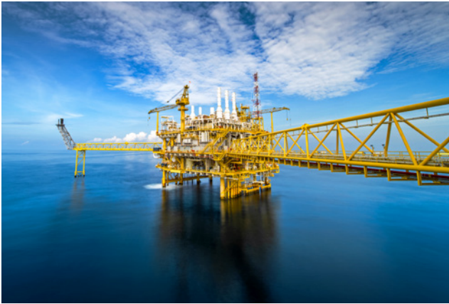
Oil and gas (upstream)