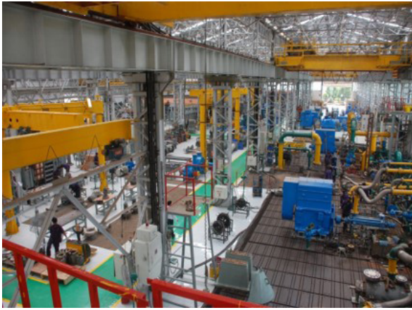
Digha test bed