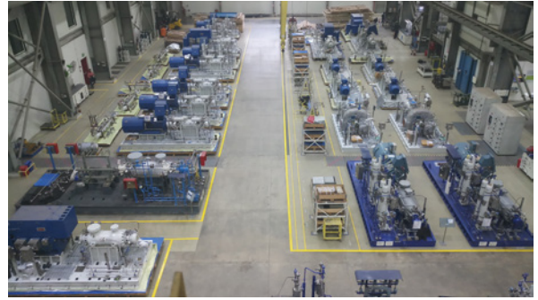
Ambarnath shop floor

How can we help you? Contact us today to find your best solution.