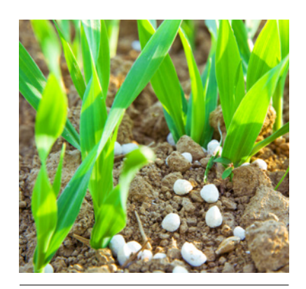
Petrochemicals and fertilizers