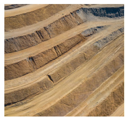
Mining and metals