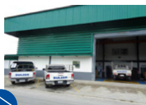
Sulzer 38/9 Ratcha Niyom, Tambon Thapma 2100 Rayong Thailand Phone +66 (38) 967 8601