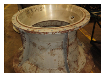
Fabricated stainless steel suction bell