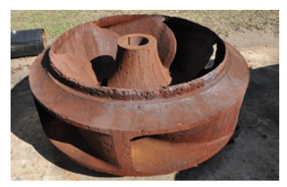
66" Impeller for dewatering service