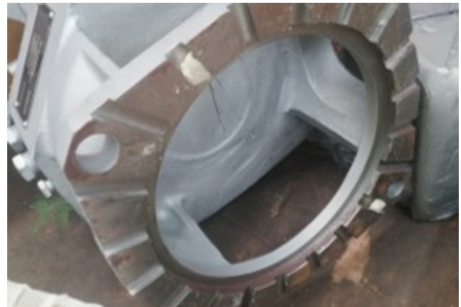
Machined ribs for cooling features to stop conduction of heat from the casing into the bearing housing