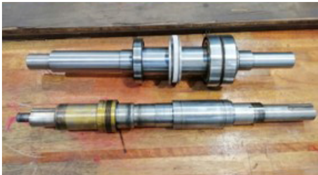
Comparison of the two shafts – top OHX, bottom HNN