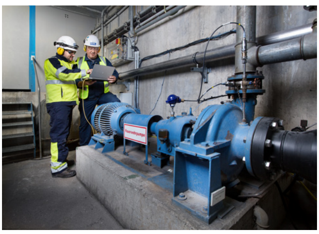
Diagnosed after DOC BOX installation: The pump is running outside its performance range