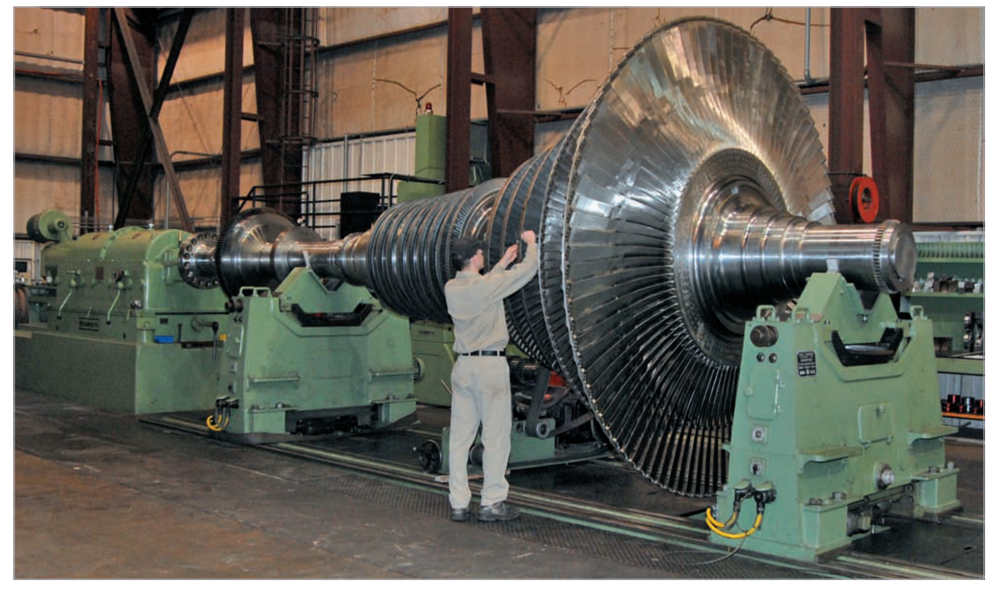
A large steam turbine for a power generation facility undergoing a lowspeed balance at the workshop. This lowspeed balance stand has a capacity for rotating elements to 50 tons at 500 rpm.

All rotors are part of a machinery train, be it a generator, gearbox, compressor or other mechanical assembly. The presence of an unbalance in any rotating component in the assembly may cause the entire train to vibrate. This induced vibration, in turn, may cause