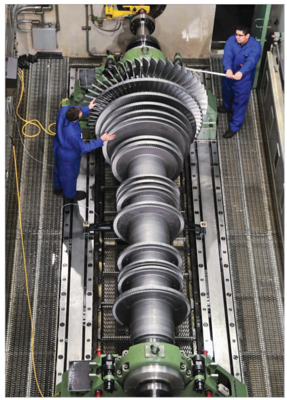
(3) High-speed steam turbine, typical of the type requiring high-speed balancing.