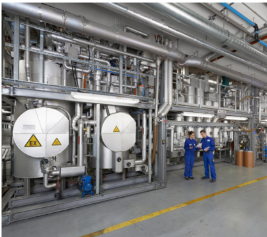
PLA biopolymer pilot plant built by Sulzer

Bio-based chemicals, fuels and plastics are future building blocks to sustainability. Each product offers their unique challenges in product recovery and purification. For more than 40 years, Sulzer has worked hands-in-hands with technology providers and end-users to develop downstream recovery and purification technologies devoted to the production of bio-based products. Our product offering ranges from process components to complete separation process plants with improved efficiency and product purity.