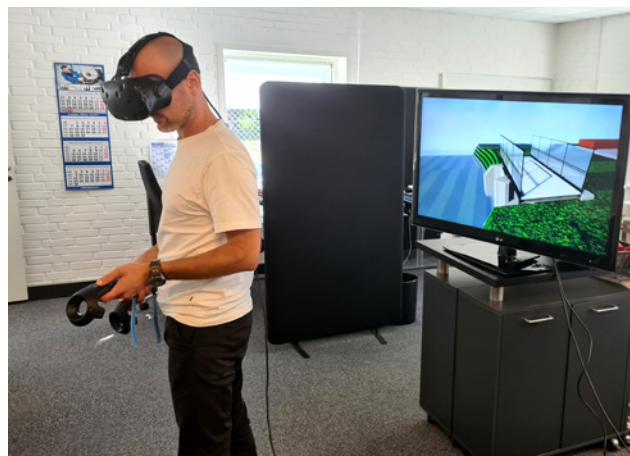
Sulzer's virtual reality simulation of the installation helped other contractors visualize the site

The assembly of the equipment started in November and the pumping stations are expected to be fully operational by the end of 2020. The equipment has been designed to meet forecast demand until 2060, at which point rising water levels mean the lock will be permanently closed and the stations upgraded as they become the only means of drainage from the reclaimed land. The new facilities have been designed to permit this change within the existing space envelope, with the whole project expected to protect the town and surrounding areas until the year 2110.