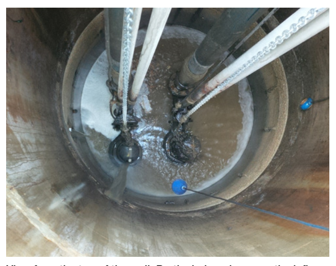
View from the top of the well. Particularly arduous as the inflow falls directly on top of the pump.

For more information on our products and services for wastewater treatment, please visit <u>sulzer.com</u>.