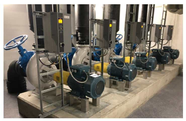
Five BE325-2532 recirculation pumping units for brackish water

Sulzer is a recognized supplier in the fish farm market, with innovative and proven pumping, mixing and aeration solutions, and provides highly energyefficient products with low life-cycle costs and the smallest possible environmental footprint. As a material specialist in a wide range of fresh water, brackish water, seawater and brine applications, we can offer pumps in cast iron, 316 stainless steel, duplex, superduplex, SMO, etc.