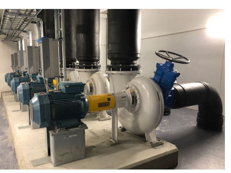
Five AHLSTAR A43-500 recirculation pumping units for brackish water