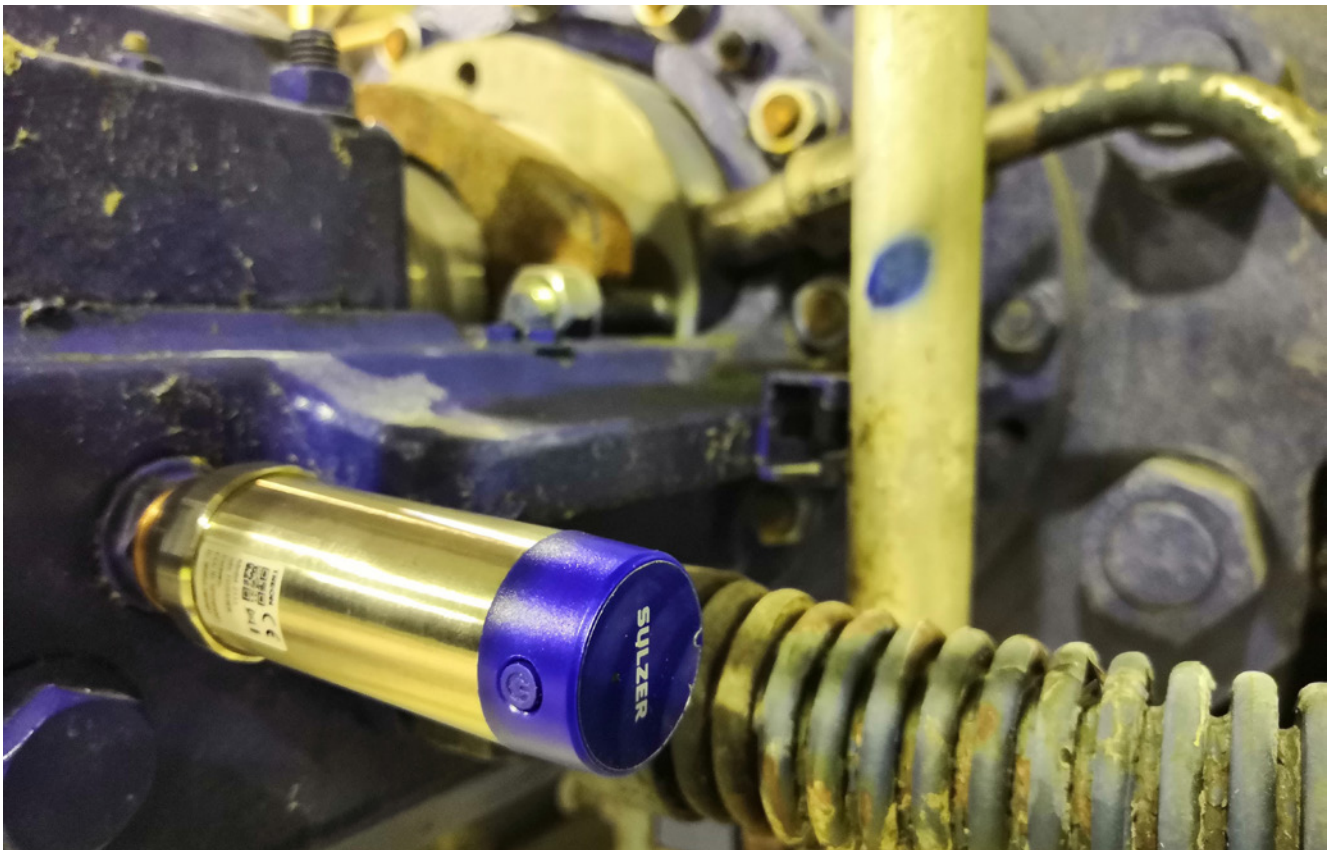
Sulzer Sense installation at a customer site