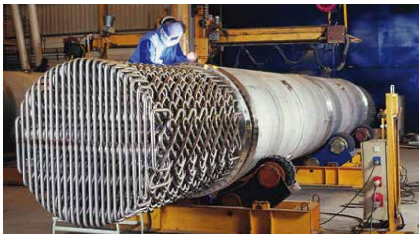
Sulzer Mixing Reactor (SMR™)

The residual monomer is continuously removed from the PLA melt in a two-stage, vacuum degassing system. The recovered unreacted lactide can be purified and recycled into the feed system. The degassed PLA is subsequently pelletized and crystallized before packaging.