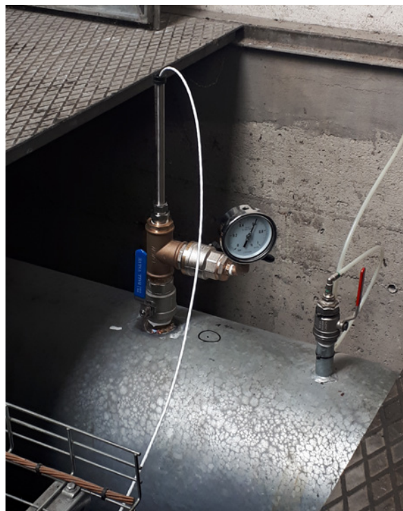
Flow and pressure data can support an energy audit and the process of raising capital for improvements.

While there are many other places where energy savings can be proportionally higher, the overall saving will be small