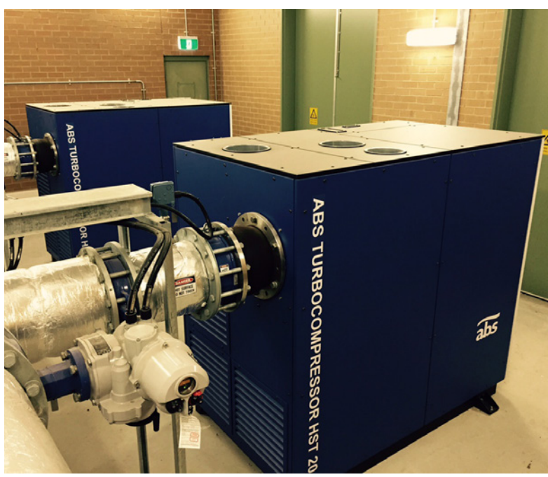
The Boneo blower room

For more information on our products and solutions for wastewater treatment, please visit <u>sulzer.com</u>.