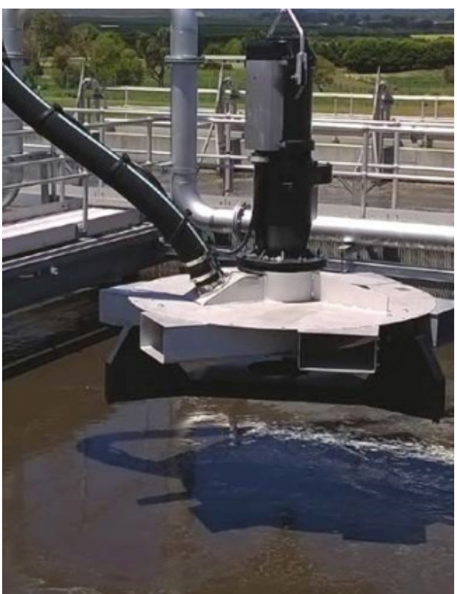
OKI aerator unit being lowered into the bioreactor