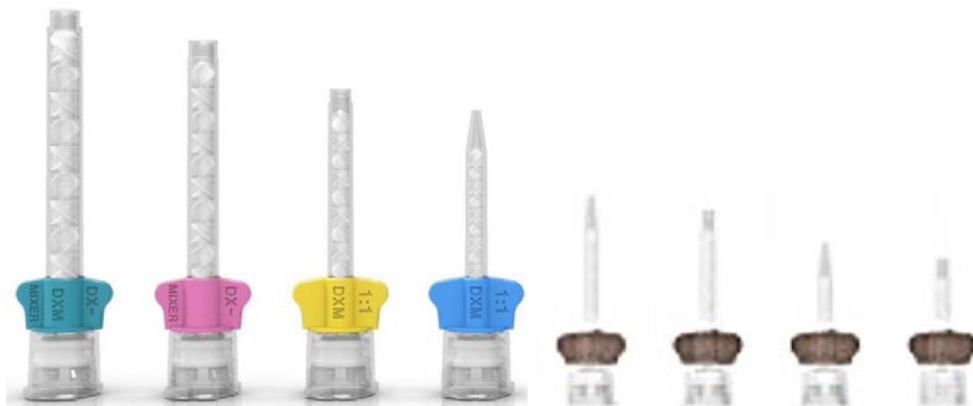
Figure A: Enjoined Mixing Tips