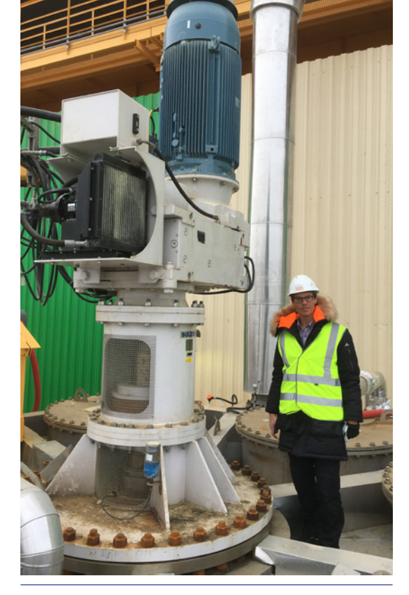
A heavy-duty Scaba 240FVPT-Sff