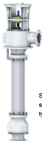
Sulzer's vertical sulfuric acid pump type VAS

Sulfuric acid is one of the most important industrial chemicals. In the contact process, circulation pumps are required for the pumping of very corrosive high-temperature and high-concentration sulfuric acid in drying towers, absorption towers, and heat recovery systems. In most cases, vertical pumps are installed at the top of a tank to provide safe operation. In this case, the design featured a vertically mounted end suction pump with the volute casing installed on a suspension column with a separate discharge pipe.