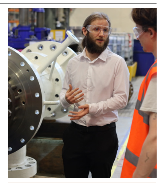
Test facilities such as our site in Leeds (UK) guarantee the highest standards and quality-tested pump equipment.