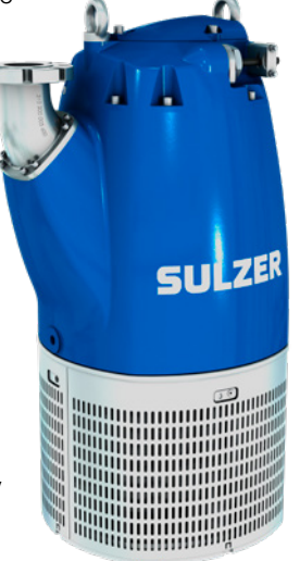
XJ 900 high-capacity dewatering pump.

ramp and stope pumping and main mine dewatering. Multiple pump technologies can be used in these applications, including submersible, vertical, end-suction, multistage or volumetric pumps. The pump type and construction materials depend on various factors, such as water properties, the presence of abrasive solids, the concentration of solids and the location of the installation.