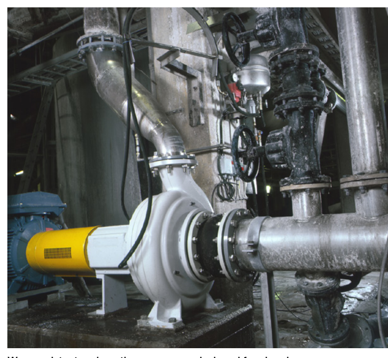
Wear-resistant end-suction pumps are designed for abrasive and erosive pumping applications.

Whilst water may be a nuisance, it is also essential for the mining process. The management of this precious resource is of critical importance.