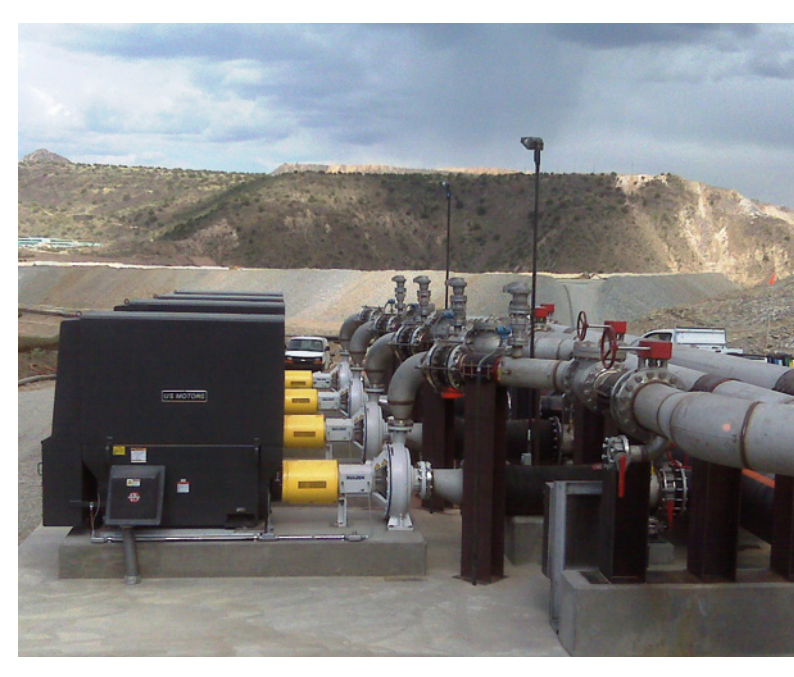
Sulzer offers a comprehensive portfolio to fulfill most minerals and metals applications.