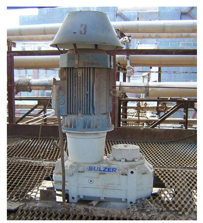
SALOMIX LV-11/71 agitator

In the manufacturing process of wet phosphoric acid (WPA), storage tanks are used in every plant. After reaction and filtration, the phosphoric acid is pumped into a storage unit. The filtrated phosphoric acid contains some chemical impurities (e.g. sulphuric acid, chlorides and fluorine) that make it aggressive. It also contains particles such as gypsum that tends to settle in the storage tanks. To avoid settling and possible plugging issues, agitation is needed in the tanks. Mixing also ensures homogeneous properties of the acid.