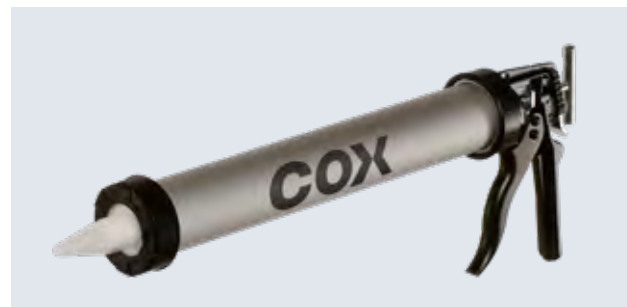
Fig. 4 COX ProFlow Combi 600 ml with lightweight, anodized aluminum barrel.