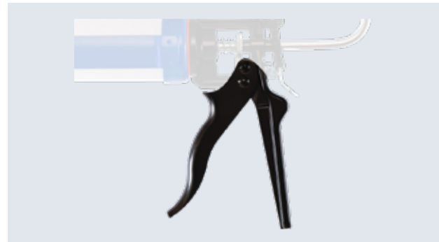
Fig. 2 ProFlow compact handle for ease of use.