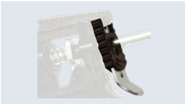
Fig. 1 No more dripping with the ProFlow pressure release device (PRD).

With the ProFlow Combi dispenser, you need only one dispenser for different filling systems. It gives complete flexibility to switch easily between cartridge or sachets. The one-component combi dispenser can be equipped with cartridges or sachets in different sizes (310/400/600 ml). Whether to use low-to-medium viscosity sealants or adhesives, the dispenser is suitable for both materials. The threaded endcap allows simple access to the barrel for insertion of materials but also provides a secure fixing while the dispenser is in use (Fig. 4).