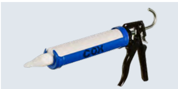
Fig. 3 COX ProFlow 310 ml with U-opening for ease of cartridge removal and insertion.