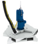
OKI submersible aerator mixer