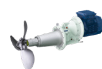
SALOMIX SSF side-mounted agitator