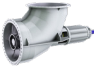
CAHR axial flow pump