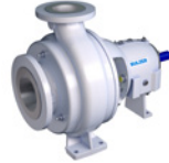
AHLSTAR N non-clogging pump