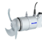
RW and XRW submersible mixers