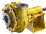
EMW slurry pump