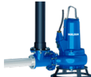
Venturi Jet submersible aerator