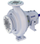
AHLSTAR W wear-resistant pump