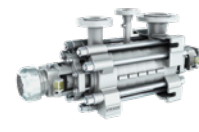
MC and MD boiler feed pumps