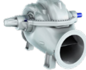
ZPP and SMD double suction pumps