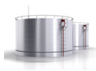
Digester Design and CFD Modeling