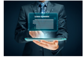
Global Technology Licenser